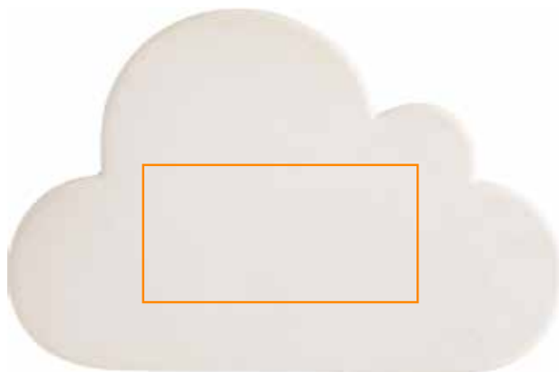
2. + 4. BACKSIDE